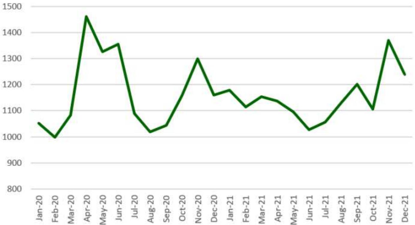
Graph showing the different parcel sizes given out in 2020 and 2021