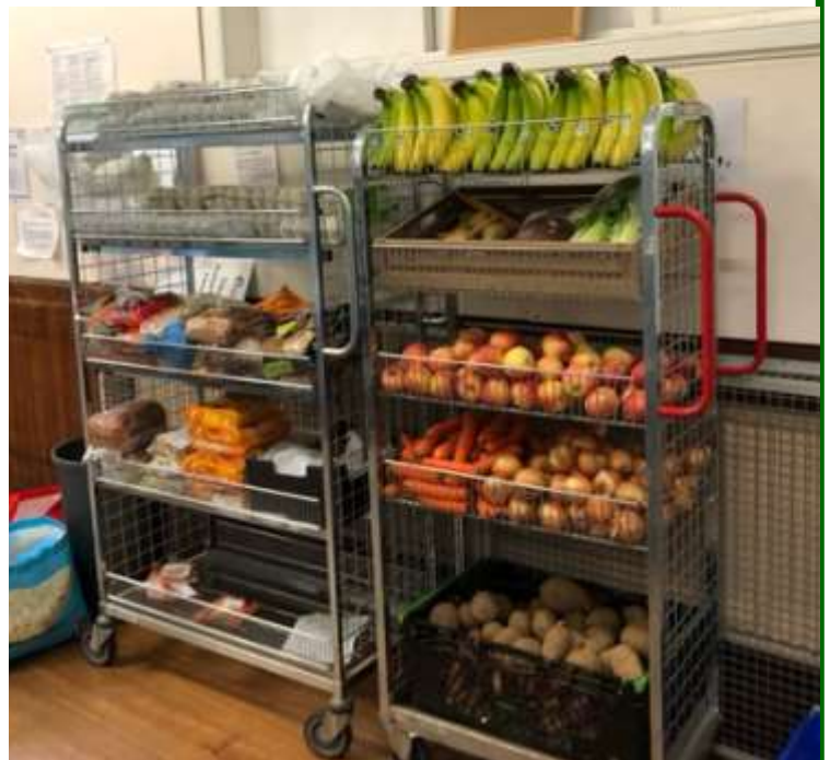
Photo of fresh fruit and vegetables at Viewforth

Looking ahead we are actively engaging with many agencies as we try to address the enormous issues